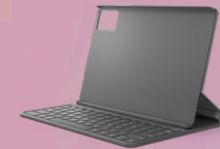
Lenovo Folio Keyboard for IdeaTab ZG38C07075