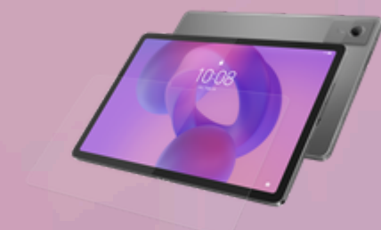
Lenovo Idea Tab Screen Protector ZG38C07003